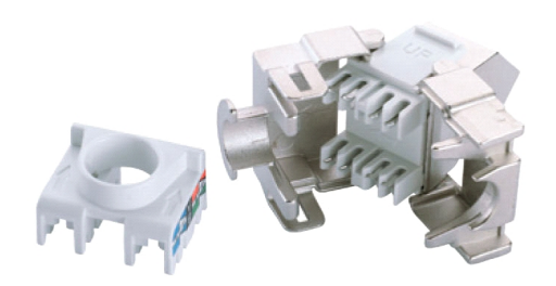
C. Rear view of Keystone with wire cap