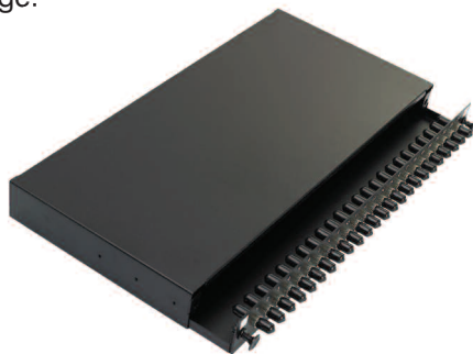
A. Sliding drawer design

The Excel range of ST patch panels are sliding drawer 'tray style' housings suitable for either direct termination or splicing of upto 24 fibres in 1u of rack space. Each panel is manufactured from high quality 2mm thick steel and finished in Black powder coated paint to provide a strong and durable unit. To the front of the patch panel the specified number of simplex adaptors are loaded from left to right. The fascia also houses the release latches for the sliding drawer. Each adaptor is fitted with a colour coded dust cap, Black for multimode, Red for singlemode. Each simplex adaptor accommodates one terminated fibre. Each panel has included within it a set of adjustable fixing arms, and a cable management pack which includes cable entry glands, cable ties, and a 24 way splice bridge.