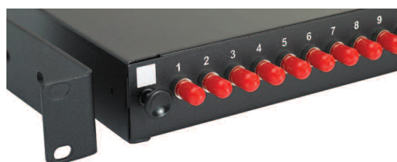
C. Adjustable fixing arms. clear port and panel labelling